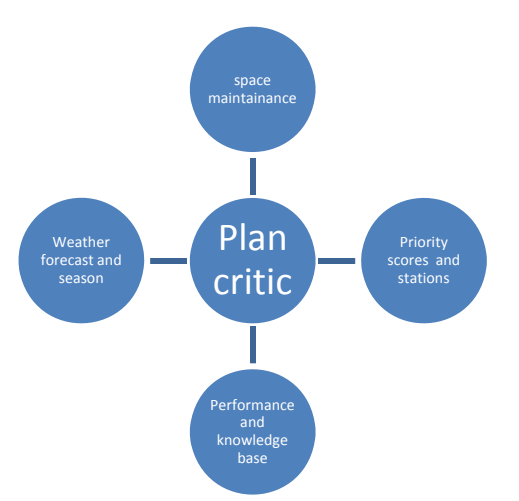
Fig: Model of the plan critic